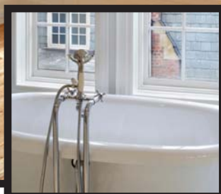
Old stained or chipped tubs and sinks can be re-porcelainized, often in your home, for a fraction of the cost to replace.