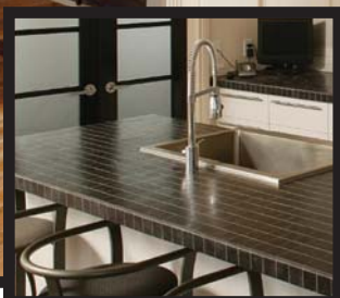
New tiles can add drama and value and are easy to do. Old battered cabinets can come alive with a fresh coat of white paint.

Do-it-yourself hardwood flooring is easy. You can even consider staining alternating wood planks, or simply stain a border on your existing floor to create a dramatic, and inexpensive new look.