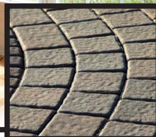
Try replacing an old driveway with easy to lay pavers. The old concrete can be used in a number of ways including a rustic pathway.

F loors, counters, sinks... anything with a surface can become worn or outdated. Whether you are remodeling or sprucing up, surfaces are a big part of the project.